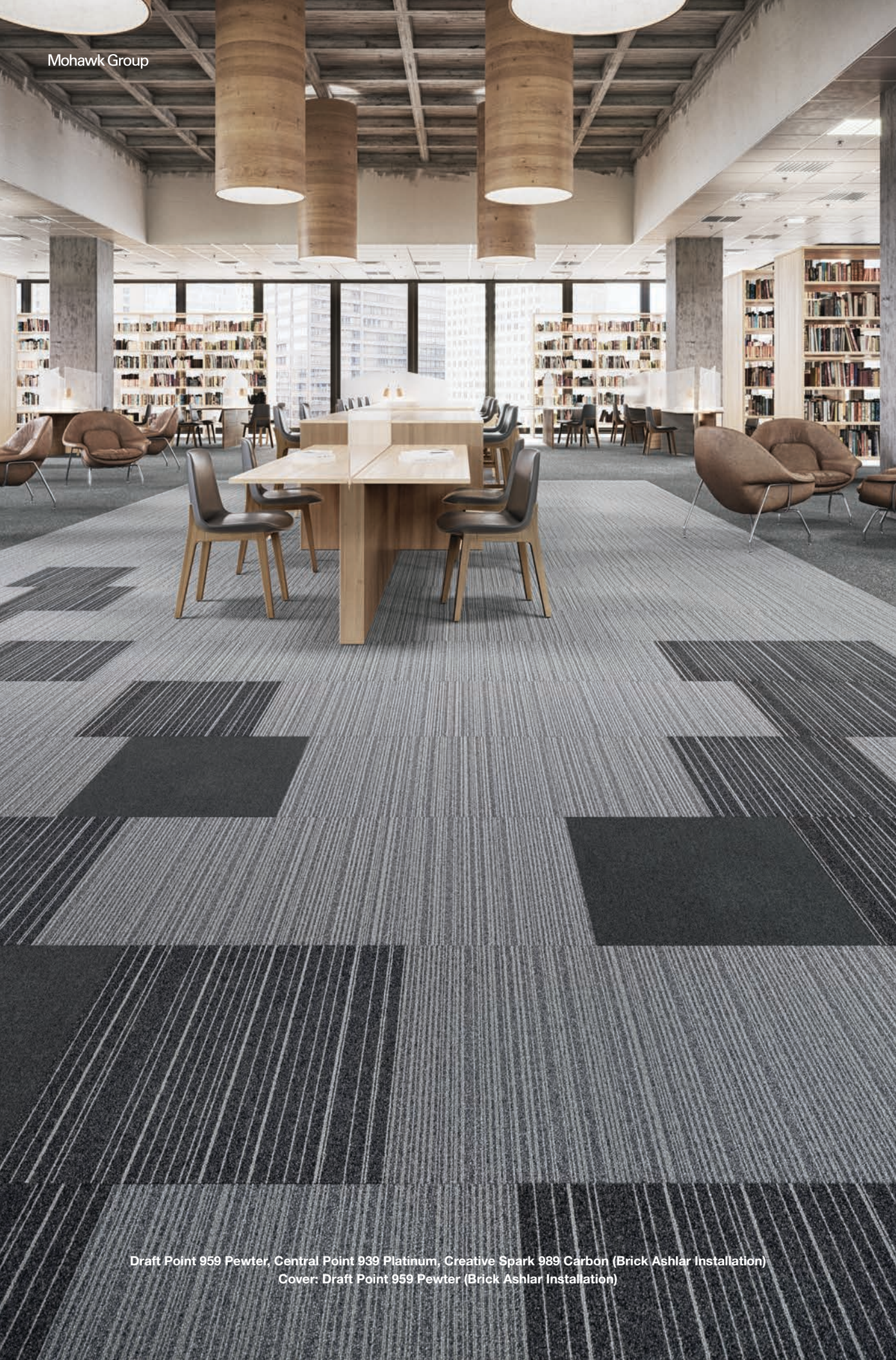
Draft Point 959 Pewter, Central Point 939 Platinum, Creative Spark 989 Carbon (Brick Ashlar Installation) Cover: Draft Point 959 Pewter (Brick Ashlar Installation)