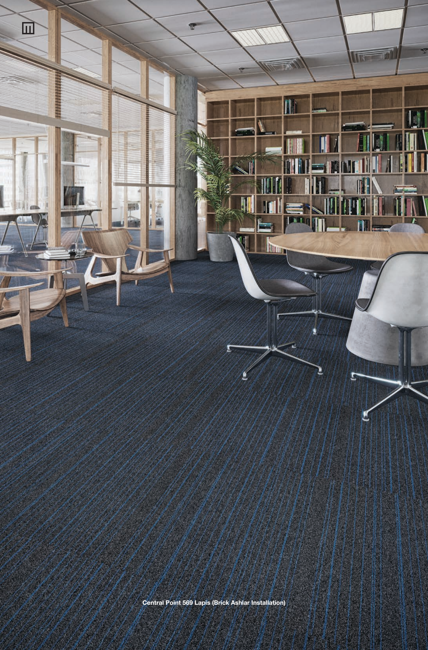
Central Point 569 Lapis (Brick Ashlar Installation)